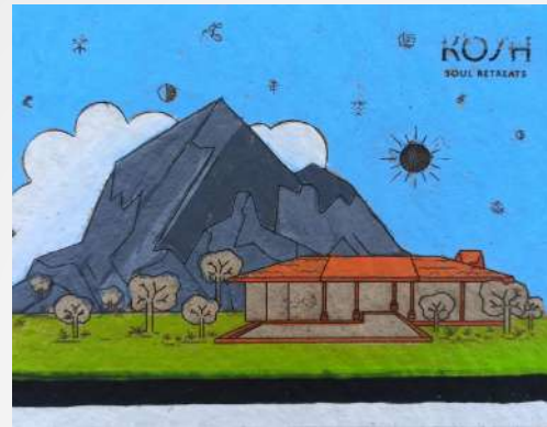
Laser engraved and Hand-painted