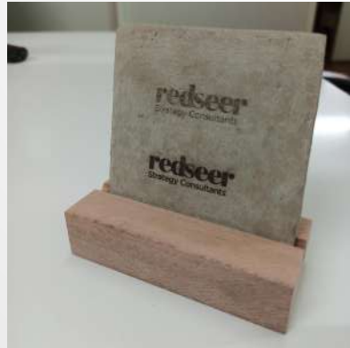
Laser etching with wooden base