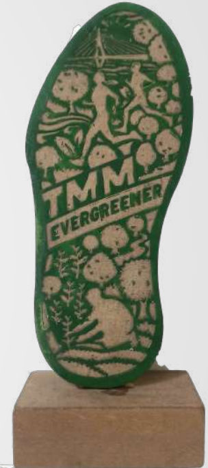
Laser Cutting engraving and Hand-painting