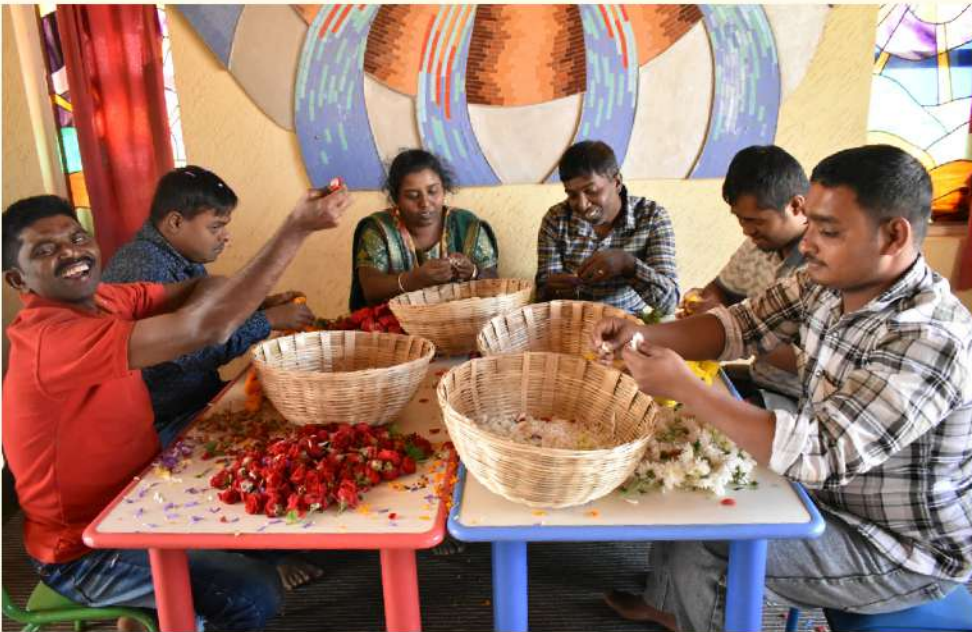
ADULTS WITH INTELLECTUAL DISABILITIES