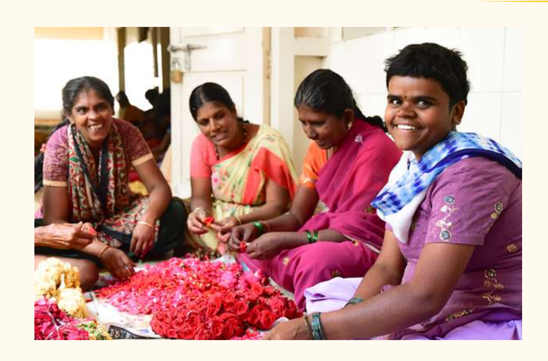
ADULTS WITH INTELLECTUAL DISABILITIES