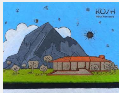
Laser engraved and Hand-painted