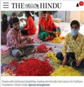
People with intellectual disabilities making skin-friendly Holi colours for Craftizen Foundation