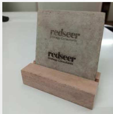
Laser etching with wooden base