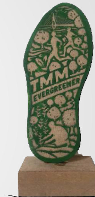
Laser Cutting engraving and Hand-painting